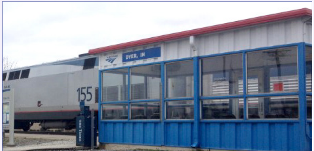
Hoosier State at Dyer, IN

IPRA, and Rail Passengers Association, will continue to advocate for the development of modern, 21st Century, passenger rail service in the Hoosier