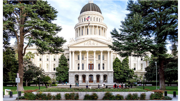
California's State Capitol

Inclusion & Equity; The Future of Rail and The Traveler Experience. The Rail Passengers' Council of Representatives will meet on Sunday morning. In addition, there will be plenty of free time to explore Sacramento, America's premier Farm to Fork food & wine destination.