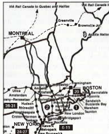
—Spring '91 Amtrak Timetable

The goal is to insure that a cross-Boston railroad link is funded along with a $5 billion highway project, the "Central Artery (I-93)/Tunnel (I-90) Project" (CA/T). Such a link would extend the Amtrak national system to Portland and other Maine points.